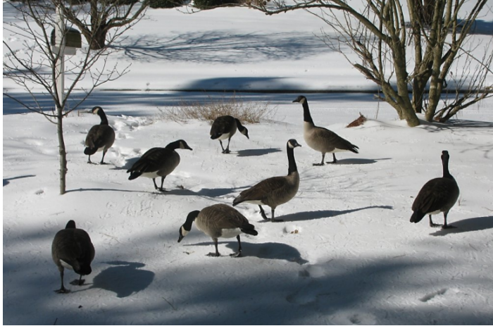
A rare snowfall in Raleigh

It rarely snows in the Triangle. You will not be able to drive in it here in the same way that you do where it snows frequently.